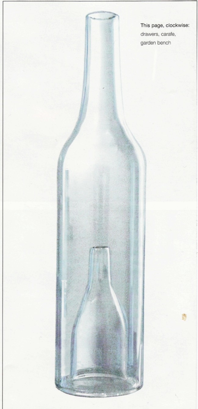
This page, clockwise: drawers, carafe, garden bench